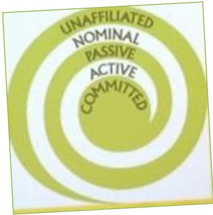
Renew International "Spiral"

not the only framework for coming to "intentional discipleship"